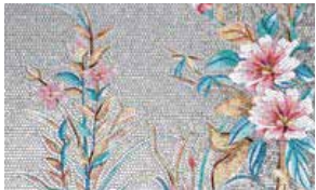
Ikebana 13 Saiku