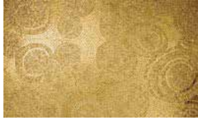
Fancy Gold 01