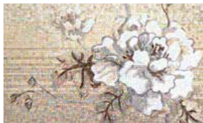
Ikebana 15 Tamaru