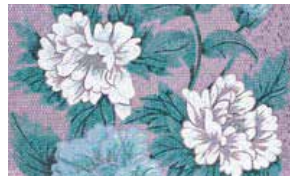
Ikebana 18 Obata